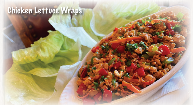
Chicken Lettuce Wraps